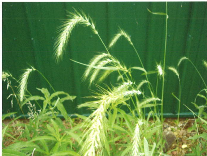
Big Sioux Nursery, Inc.