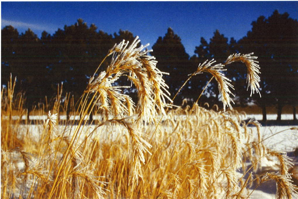
USDA-NRCS Plant Materials Center