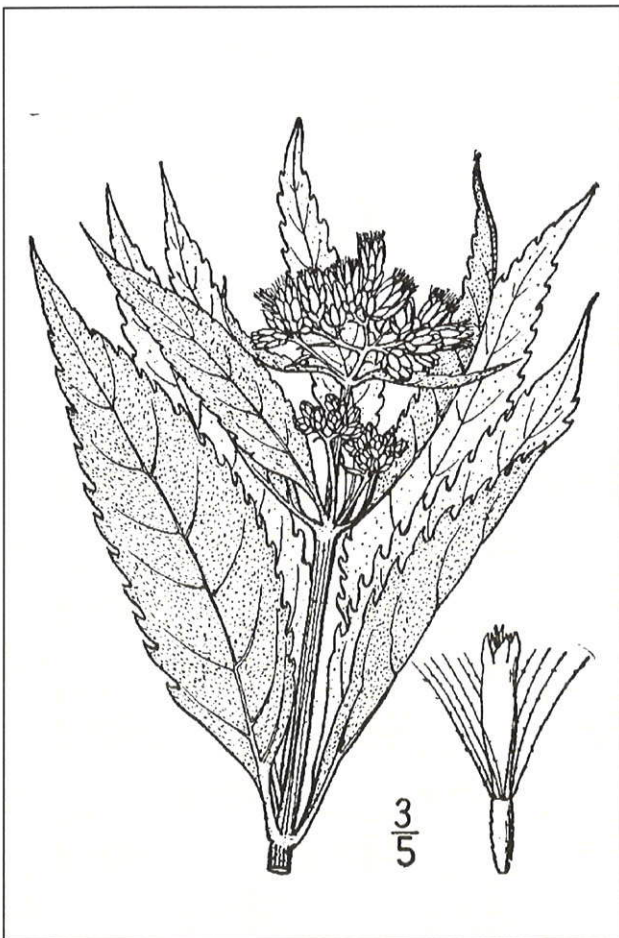
USDA-NRCS Plants Database