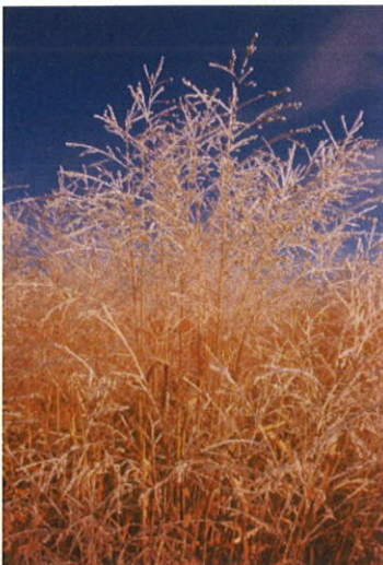
USDA-NRCS Plant Materials Center