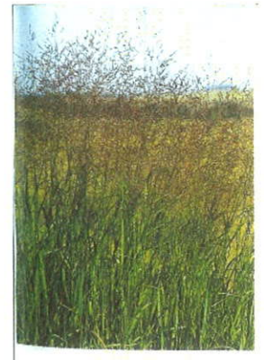
SDSU Ag Experiment Station